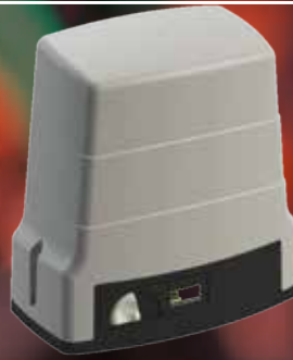
BH30 SERIES UP TO 1.000KG