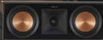
RP-500C CENTER SPEAKER