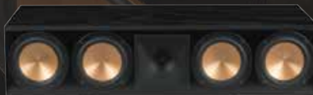
RC-64III CENTER CHANNEL SPEAKER