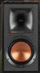
R-51M MONITOR SPEAKERS