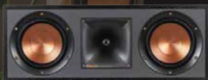
R-52C CENTER SPEAKER