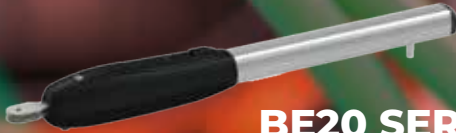
BE20 SERIES UP TO 4.5 MT