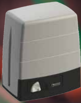
BM30 SERIES UP TO 400KG