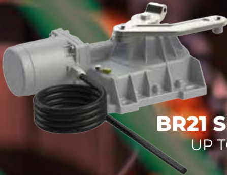
BR21 SERIES UP TO 3.5 MT