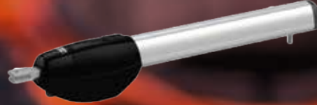
SMARTY UP TO 7 MT