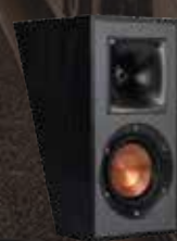
R-41SA SURROUND SPEAKERS WITH DOLBY ATMOS® TECHNOLOGY DOLBY ATMOS®