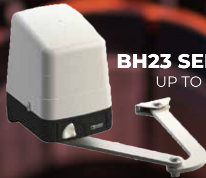
BH23 SERIES UP TO 2.5 MT