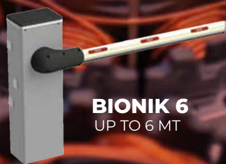
BIONIK 6 UP TO 6 MT