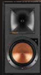
R-51PM POWERED MONITOR SPEAKERS Bluetooth®