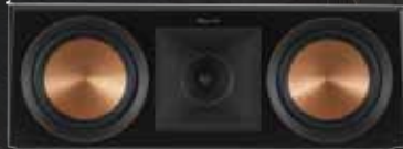
RP-600C CENTER SPEAKER