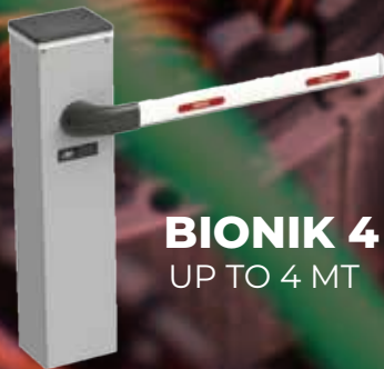
BIONIK 4 UP TO 4 MT