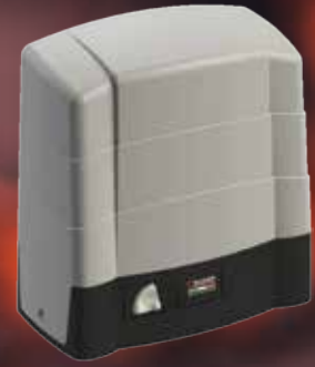
BG30 SERIES UP TO 2.200 KG