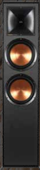
R-820F FLOORSTANDING SPEAKER